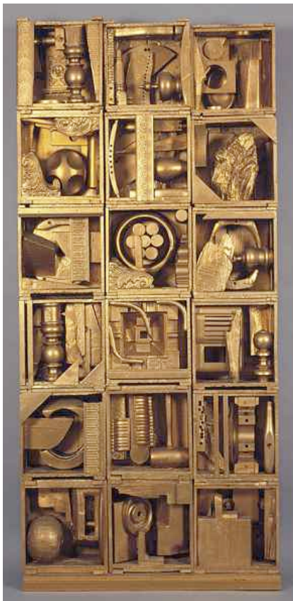
Louise Nevelson, Royal Tide I , 1960, painted wood, 86 x 40 x 8 inches. Collection of Peter and Beverly Lipman. © Estate of Louise Nevelson / Artists Rights Society (ARS), New York.

the function of discarded materials. Assemblage art is a term for using random or discarded objects to create sculptures that are socially, culturally, and personally indicative of one's environment. Students have the freedom to create abstractly by means of incorporating pre-existing and familiar objects that have some sort of previous significance. In a three-dimensional format, random items such as broken toys, used boxes, or old containers can be used to express a variety of statements that instill a curiosity for investigating an explanation. Due to its intent and obscurity, assemblage artists such as Louise Nevelson, Isaiah Zagar, and Phoebe Washburn create works that seem to speak for itself as a narrative piece.