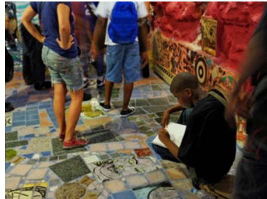
The PMG workshop is a community-based organization that educates students and teachers on cultural and historical influences in the mosaic assemblage art form and the creation of "green" spaces through the reuse of materials.

of ceramics, mirrors, and other items to the facades of run-down buildings in his neighborhood. These facades became perceived as works of art and were aesthetically appreciated and revered by the local community.