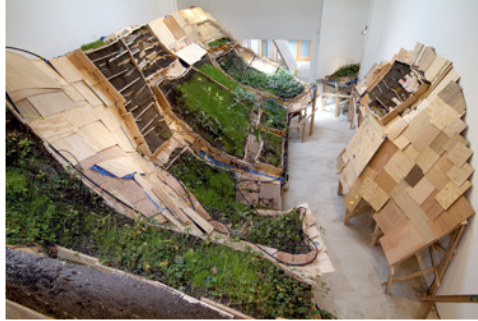
Phoebe Washburn, It Makes for My Billionaire Status , 2005 (installation view, Kantor/Feuer Gallery, Los Angeles, 2005).

Phoebe Washburn is a contemporary artist who is best known for creating architectural ecosystems from recyclable trash (Greben, 2009). She recycles discarded cardboard, plastic, wood, and more. Assembled and displayed in large areas, Washburn's enormous installations usually intertwine plant life with the mass amounts of discarded items to create a complex environmental eco-system.