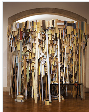
Phoebe Washburn, "Manning Stay Station" 2005,

Assemblage art is also constructed with other forms of recycled materials, such as cardboard, junk mail, and newspapers.