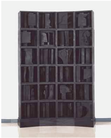
Louise Nevelson, Self-Portrait: Silent Music IV , 1964, wood painted black, 90 x 65 ½ x 18 in. (229 x 166.5 x 46 cm). Hyogo Prefectural Museum of Art, Japan.

or interests. 'Self-Portrait: Silent Music IV' , which was sculpted in 1964, is constructed from formed wood pieces and painted black.